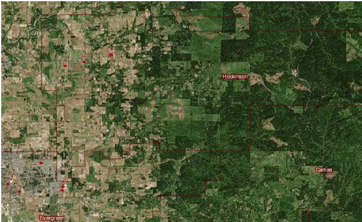
Figure 2.2 Hockinson School District and Vicinity