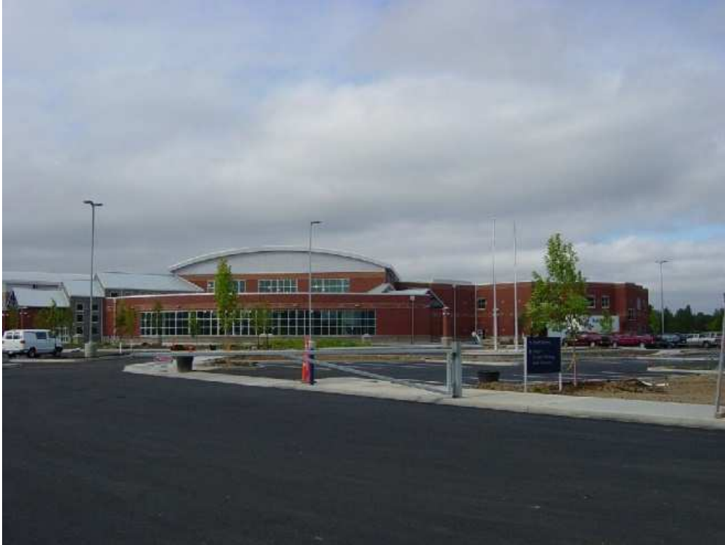
Hockinson High School

The Mission of Hockinson School District is: