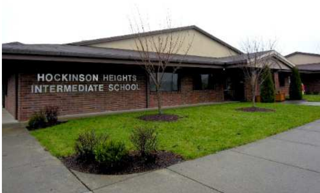
Hockinson Heights Elementary School (formally Hockinson Heights Primary and Intermediate School)