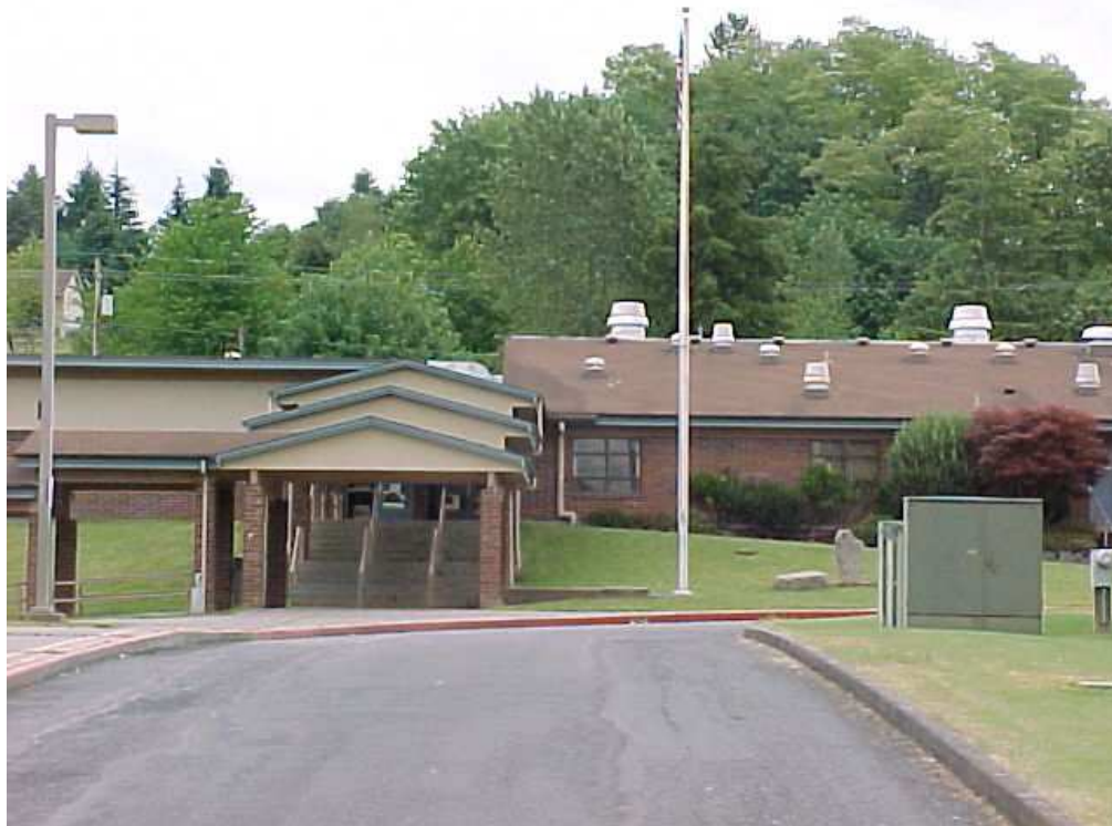
Hockinson Middle School